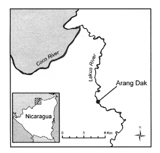
Figure 2. The geographic location of the ethnoarchaeological location of Arang Dak in Nicaragua.

Figure 1. The geographic locations of archaeological sites in the Ohio River valley sampled: Bullskin Creek (33Ct29), Dupont (33Ha11), Newtown Firehouse (33Ha419), Schomaker (33Ha400), and Stateline (33Ha58).